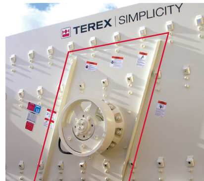
Vertical Ribbed Reinforcement Plate