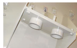
Replaceable Spring Guide